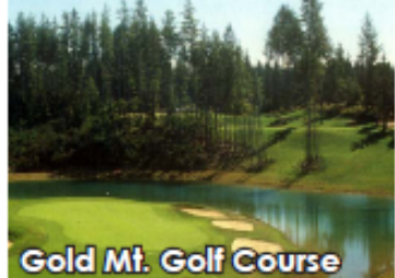
Gold Mt. Golf Course