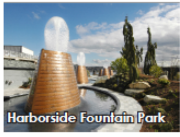
Harborside Fountain Park