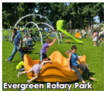
Evergreen Rotary Park