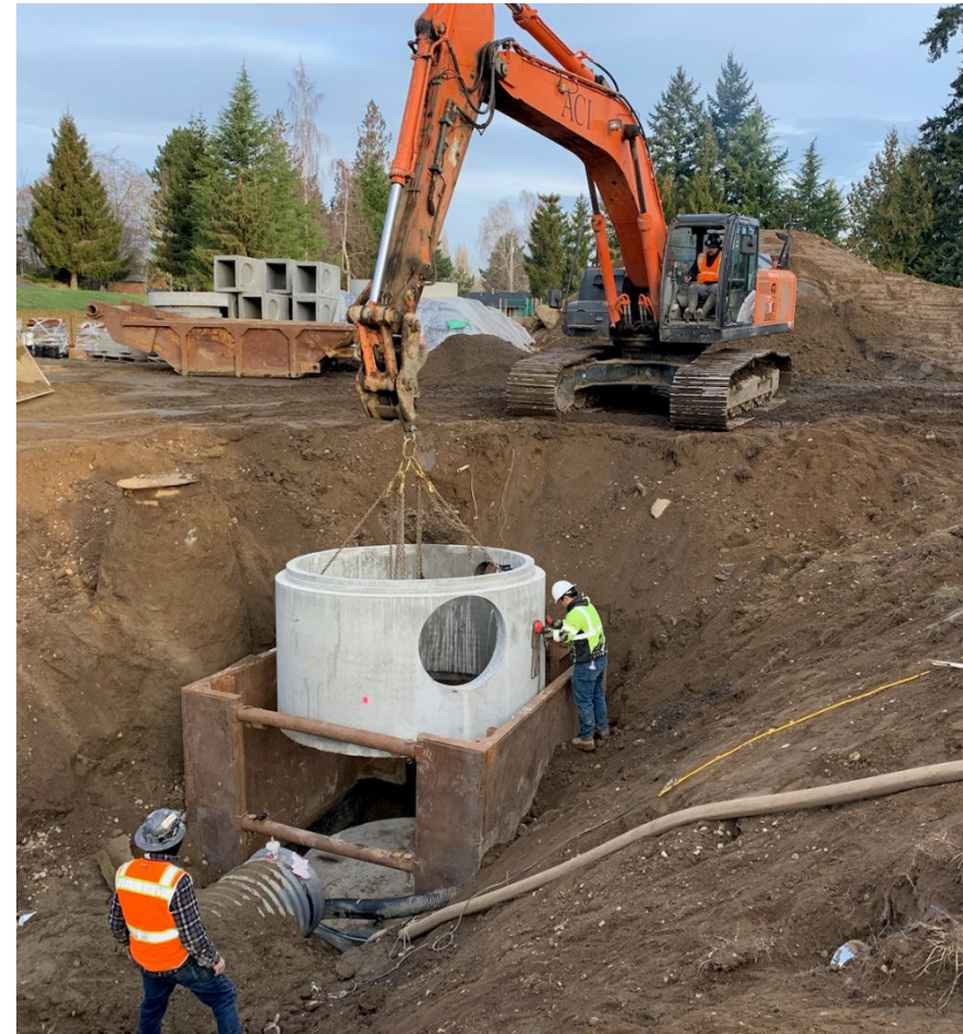
Setting the base for new 96-inch catch basin at the Church of the Nazarene this morning