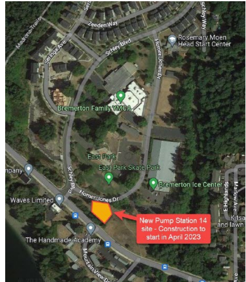
New Pump Station 14