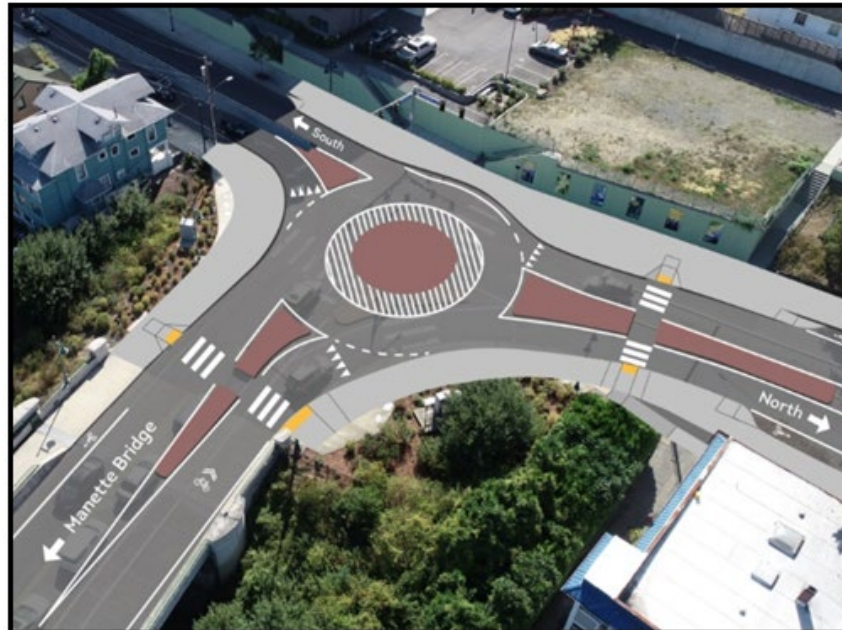
Rendering of Proposed Roundabout