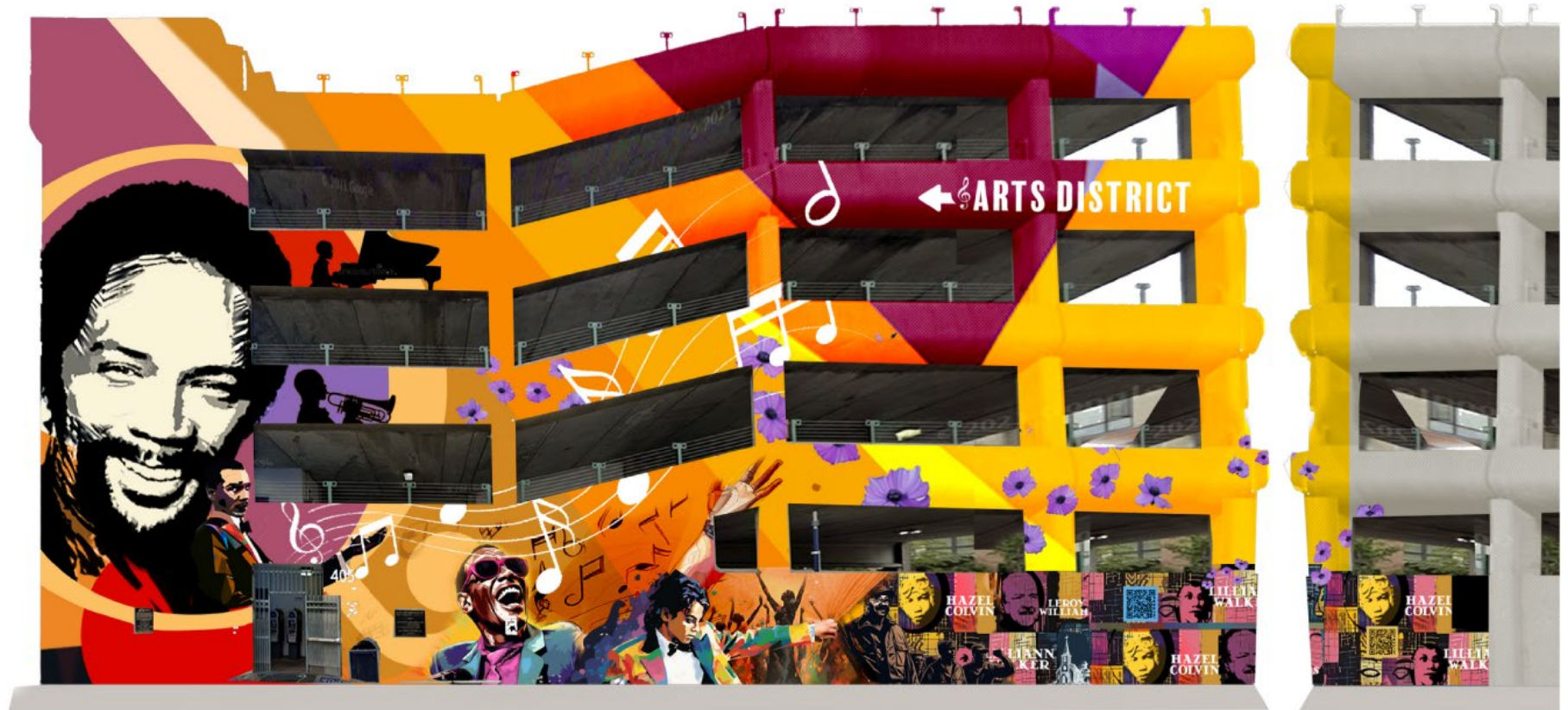
4 th Street Side