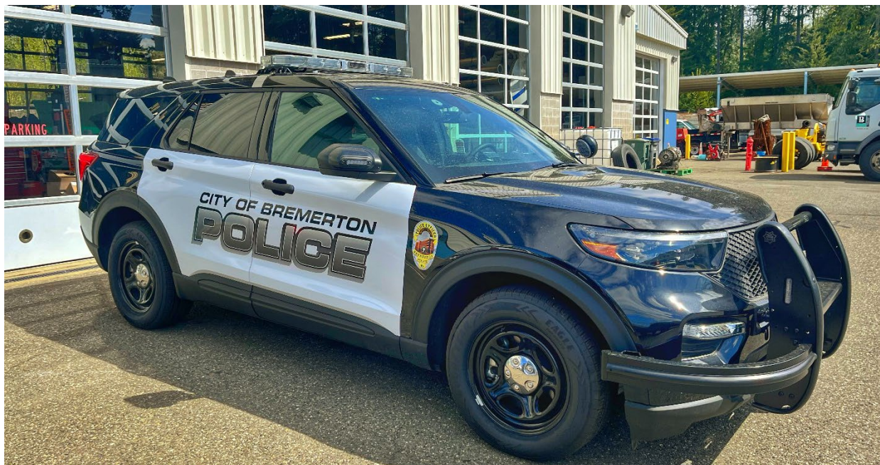
Completed Police Patrol Vehicle upfit with all required hardware