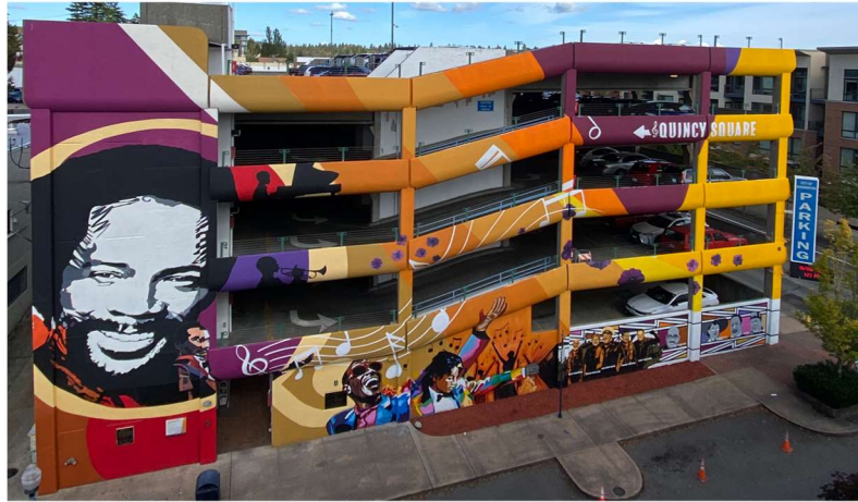
Quincy Square Mural, 4 th and Washington, Bremerton WA

The City of Bremerton seeks art for two (2) Service Cabinets located in Quincy Square depicting Bremerton's rich African American history, with a focus on the great Quincy Jones & music.