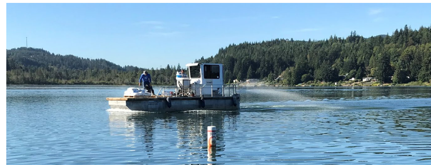
Eutrosorb-G Phosphorus Treatment Application