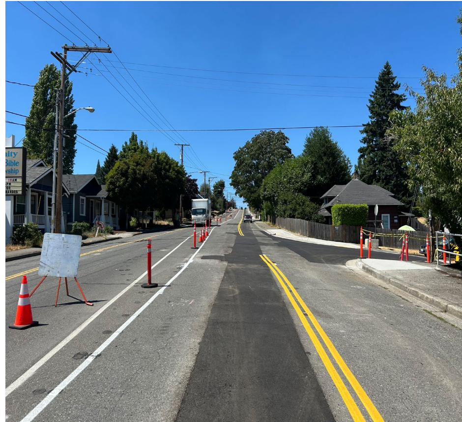
6 th Street at Broadway looking west – New Lane Shift

Thank you for your support as we complete this important community investment.