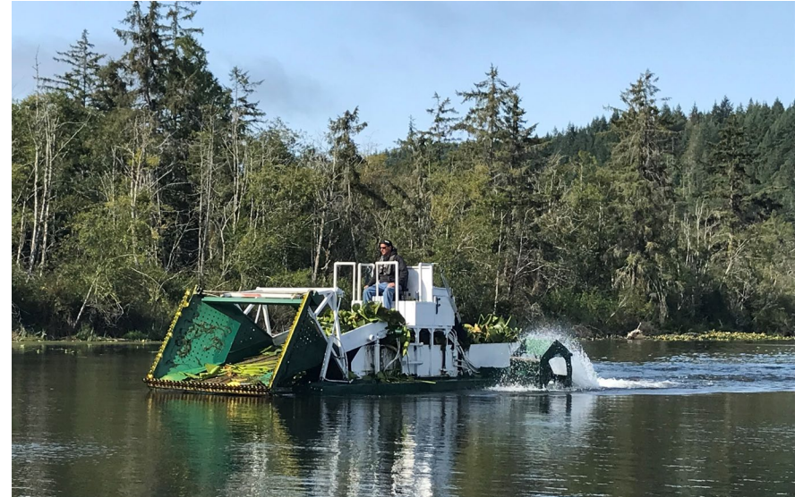
Aquatic Weed Harvesting Activities

Questions on the program can be directed to Will Riley at 360-473-5207 or will.riley@ci.bremerton.wa.us .