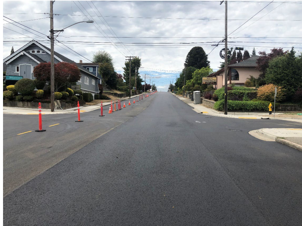
6 th Street at Chester looking west – New Pavement

Thank you for your support as we complete this important community investment.