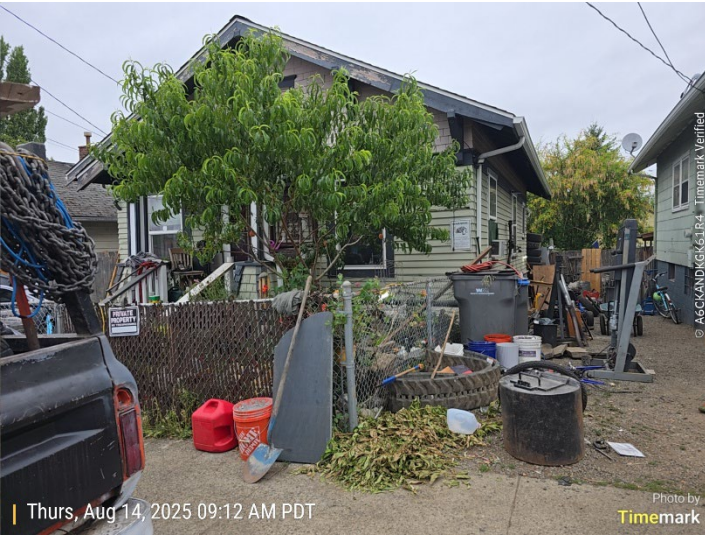
Thurs, Aug 14, 2025 09:12 AM PDT