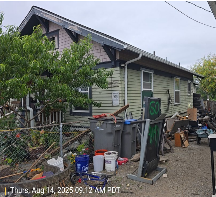
Thurs, Aug 14, 2025 09:12 AM PDT