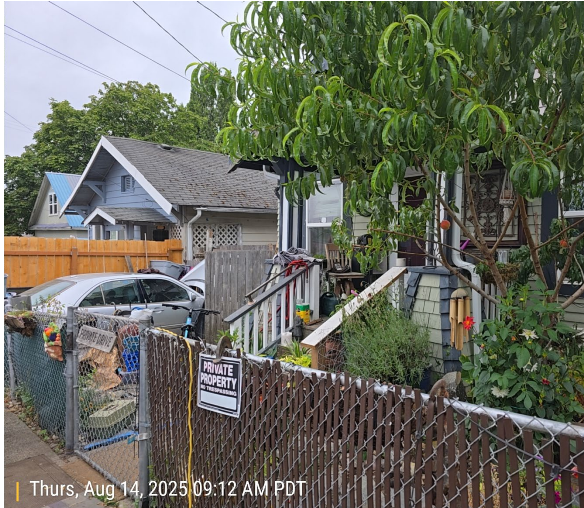
Thurs, Aug 14, 2025 09:12 AM PDT