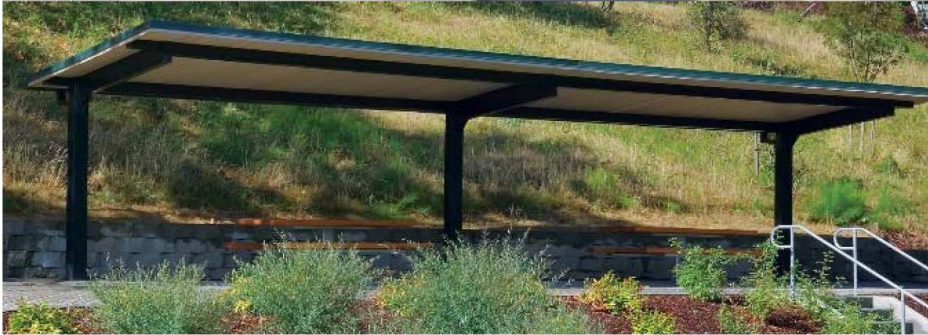
Example of Shelter