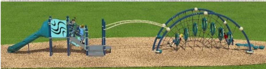
Example of Children's Play Area