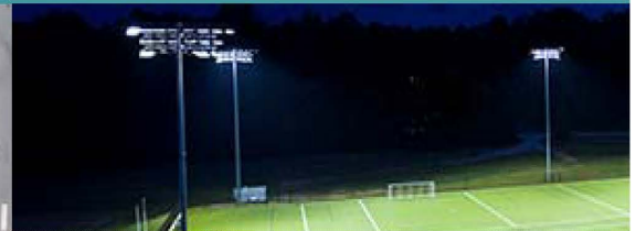
LED Playfield Lighting