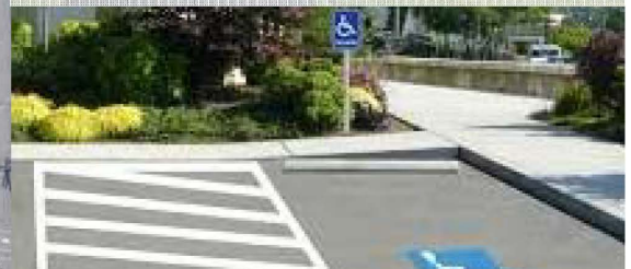
Paved Accessible Parking