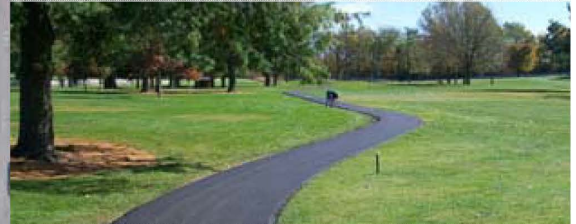
Pathway Connecting Features