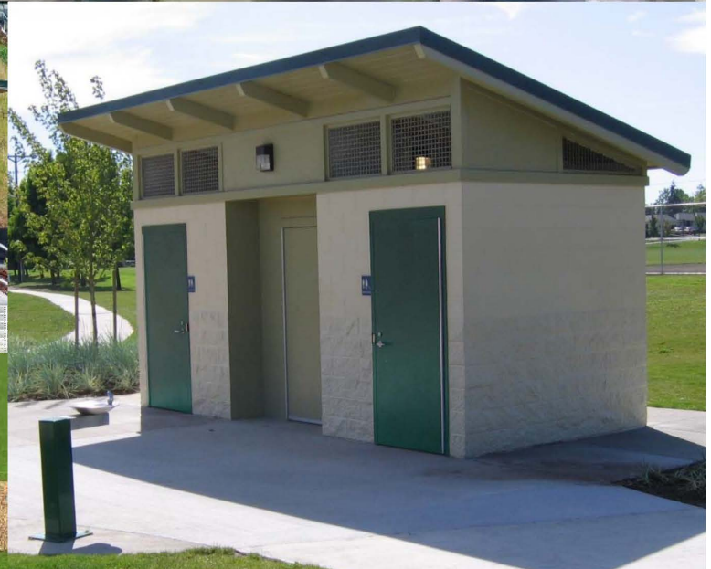
Example of Restroom & Drinking Fountain