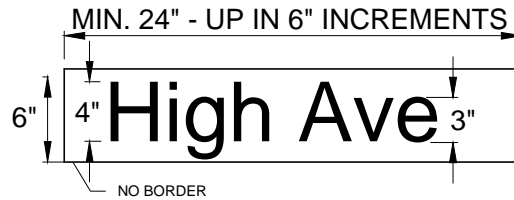
LOCAL ACCESS/ COLLECTORS