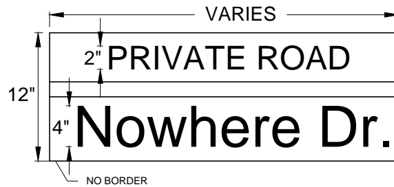
PRIVATE STREET SIGN