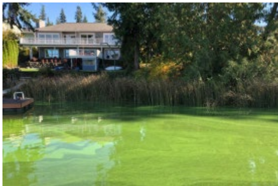
After – August 2021