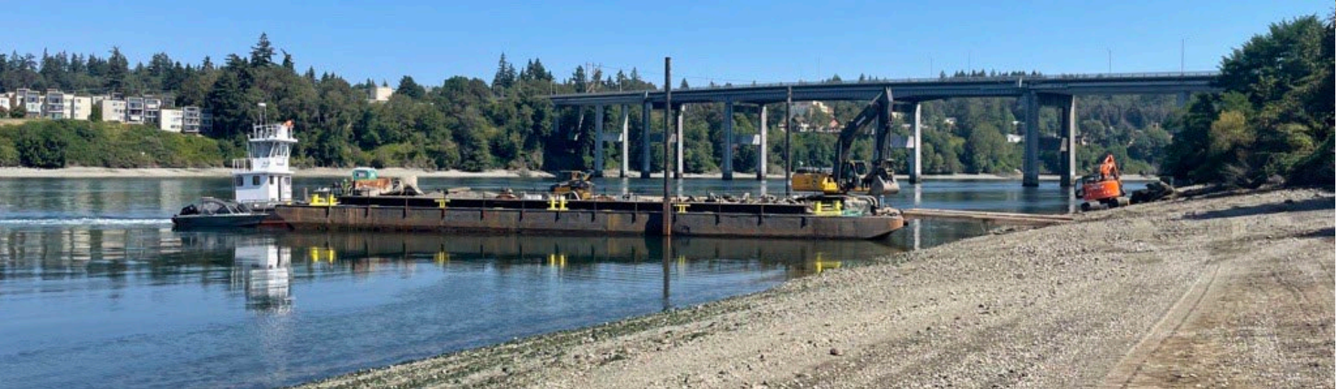
The barge and excavator are working together to place abandoned pipe onto the barge for taking off-site.